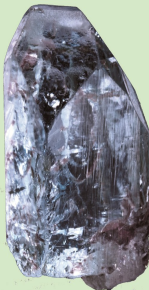
Colorado Topaz

Minerals • Fossils • Gemstones Jewelry • Beads • Decorator Pieces Meteorites • Lapidary • Metaphysical